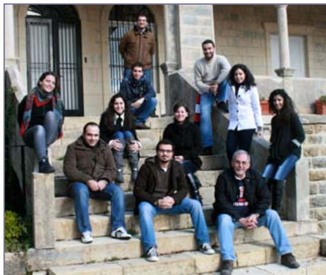
The 20PLUS! Leaders-in-Training Group in Lebanon