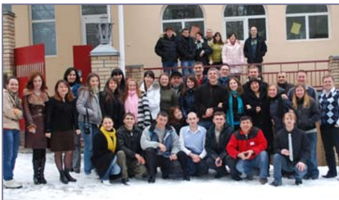
Regional Staff Conference in Kiev, March 2010

Low Points: Most of the discouragements are around the difficulties of working in poor, corrupt nations. Emigration of nationals continues. Relationships between denominations & churches are often weak/poor. There is a cultural tendency to mistrust which affects growth of collaborative initiatives in